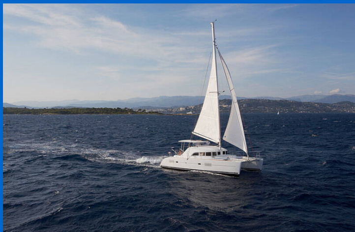
Lagoon 380 - Mention obligatoire/Mandatory credit: © photo - Nicolas Ciana

Catamaran Lagoon 380 EPSILON, built in 2018 is anchored in the Šibenik, Marina Zaton, Šibenik region, Croatia. It has 4 cabins, can accommodate 8 + 2 people and has 2 toilets. Bed linen and kitchen equipment are included in the price.