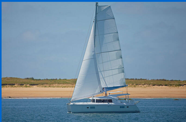
Lagoon 421 - le a'Yeu - Juin 2009 - Mention obligatoire / Mandatory credit: Photo Nicolas Clais

Catamaran Lagoon 421 TRAVIATA 1, built in 2014 is anchored in the Whitsundays, Airlie Beach, Coral Sea Marina, Whitsunday Region of Queensland, Australia and Oceania . It has 4 cabins , can accommodate 9 + 2 people and has 4 toilets . Bed linen and kitchen equipment are included in the price.