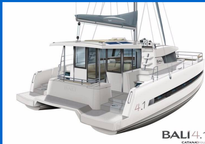
BALI 4.1 CATANA Group

Catamaran Bali 4.1 CALLUNE, built in 2020 is anchored in the New Caledonia, Noumea, Port Moselle, New Caledonia, New Caledonia. It has 4 + 2 cabins, can accommodate 8 + 2 + 2 people and has 4 toilets. Bed linen and kitchen equipment are included in the price.